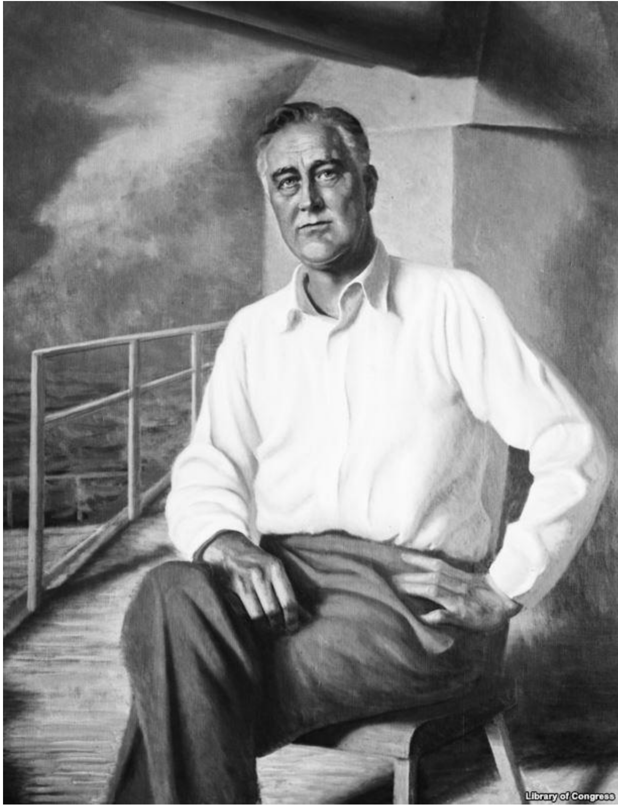
Franklin Delano Roosevelt